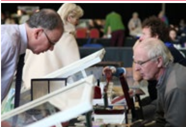
Valuations and Cash paid for Notes, Coins and Stamps