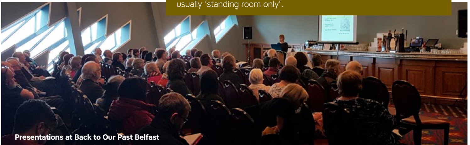
Presentations at Back to Our Past Belfast

The general presentation programme, featuring experts from all areas of genealogy and family/social history has been one of the most popular features of Back To Our Past since Day One. These free presentations are a major attraction for visitors to the event and are usually 'standing room only'.