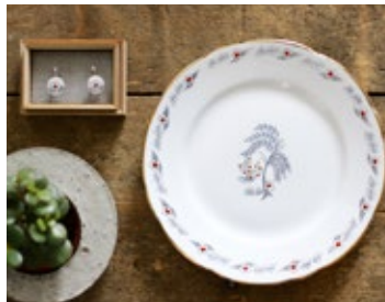
Arts & Crafts Workshops