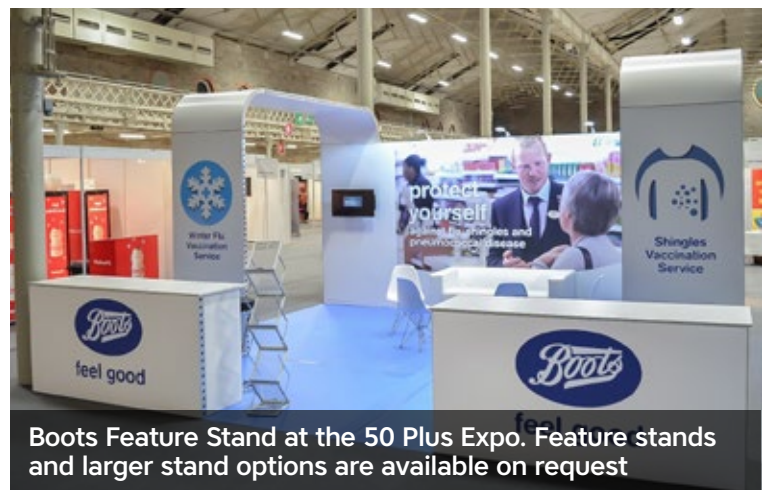
Boots Feature Stand at the 50 Plus Expo. Feature stands and larger stand options are available on request