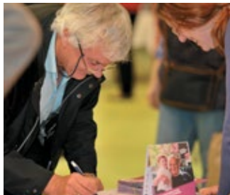
Holiday Comps & Giveaways