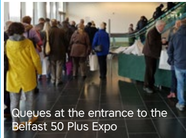
Queues at the entrance to the Belfast 50 Plus Expo