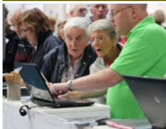
Trace Your Family History