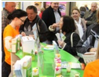
Sampling & Giveaways