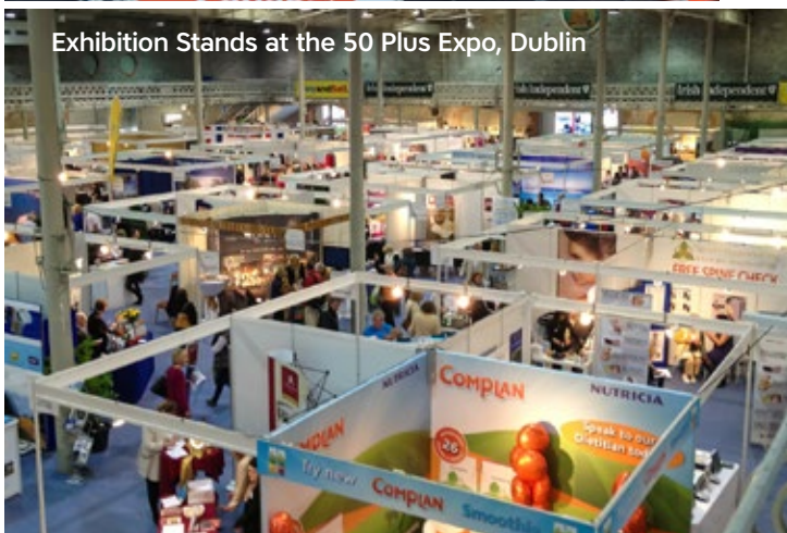
Exhibition Stands at the 50 Plus Expo, Dublin