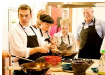
Cooking Demos & Food Sampling