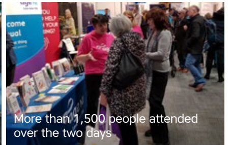
More than 1,500 people attended over the two days